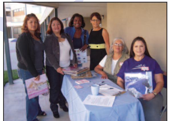
Greeters at our first parenting seminar